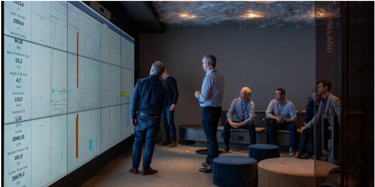
Image: The atrium is part of the 13 rooms of the OCC. Designed as a modern space for town-hall meetings and multidisciplinary collaborative sessions for larger groups.