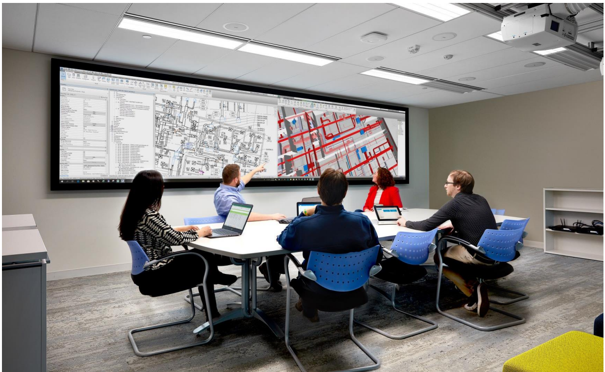
Image: The multipurpose room in Arup Boston office with its blended projection solution creates the perfect canvas for cross-functional design, project management and decision-making.

Arup, the global engineering and consulting firm, was on the look-out for a new multipurpose room in their Boston office. A room that would become an immersive and multidisciplinary collaboration room for their engineering projects and BIM (Building Information Modelling) applications. Cyviz stood out with its standardization offering as it allowed for a consistent user experience and centralized IT support. As a result, Arup could bring their resources together and use digital tools and drawings in collaboration sessions to improve decision-making. Effective collaboration is key at Arup and allows the expertise of each member of its multidisciplinary project teams to be combined. The standardized turnkey solution Cyviz proposed for Arup's Boston office consisted of a display solution with three projectors, blended to create one large seamless image together with a control and management system, supported through a centralized server.